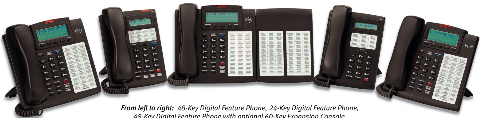
From left to right: 48-Key Digital Feature Phone, 24-Key Digital Feature Phone, 48-Key Digital Feature Phone with optional 60-Key Expansion Console, 12-Key Digital Feature Phone, Remote IP Feature Phone

Each IVX E-Class system includes a sophisticated automated attendant with six levels and 100 branches. This unusual flexibility makes it easy to set up auto-answering that saves time and conveniently routes callers to their desired extensions, departments, or even destinations outside the system. And if you prefer to answer calls "live," the auto attendant can help with overflow situations — so calls are always answered.